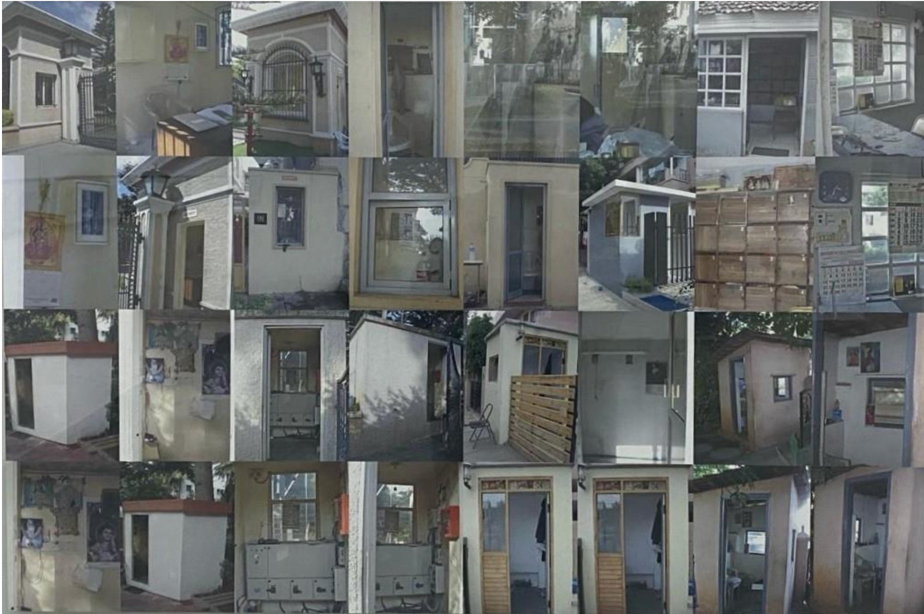
Ayisha Abraham National Security Archival print 28 x 41.5 inches 2008