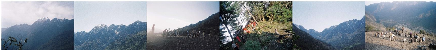
Ayisha Abraham One Way (Video) 14:05 mins 2006