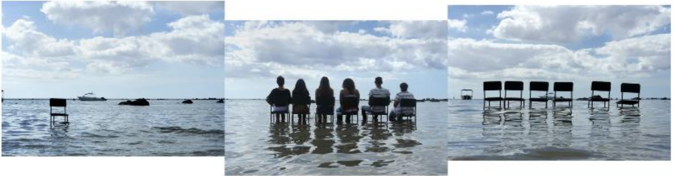
Surekha Sea Watchers 3 Archival print Size variable 1st of 8 editions 2019