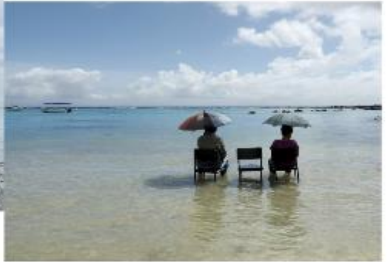
Surekha Sea Watchers 4 Archival print Size variable 1st of 8 editions 2019