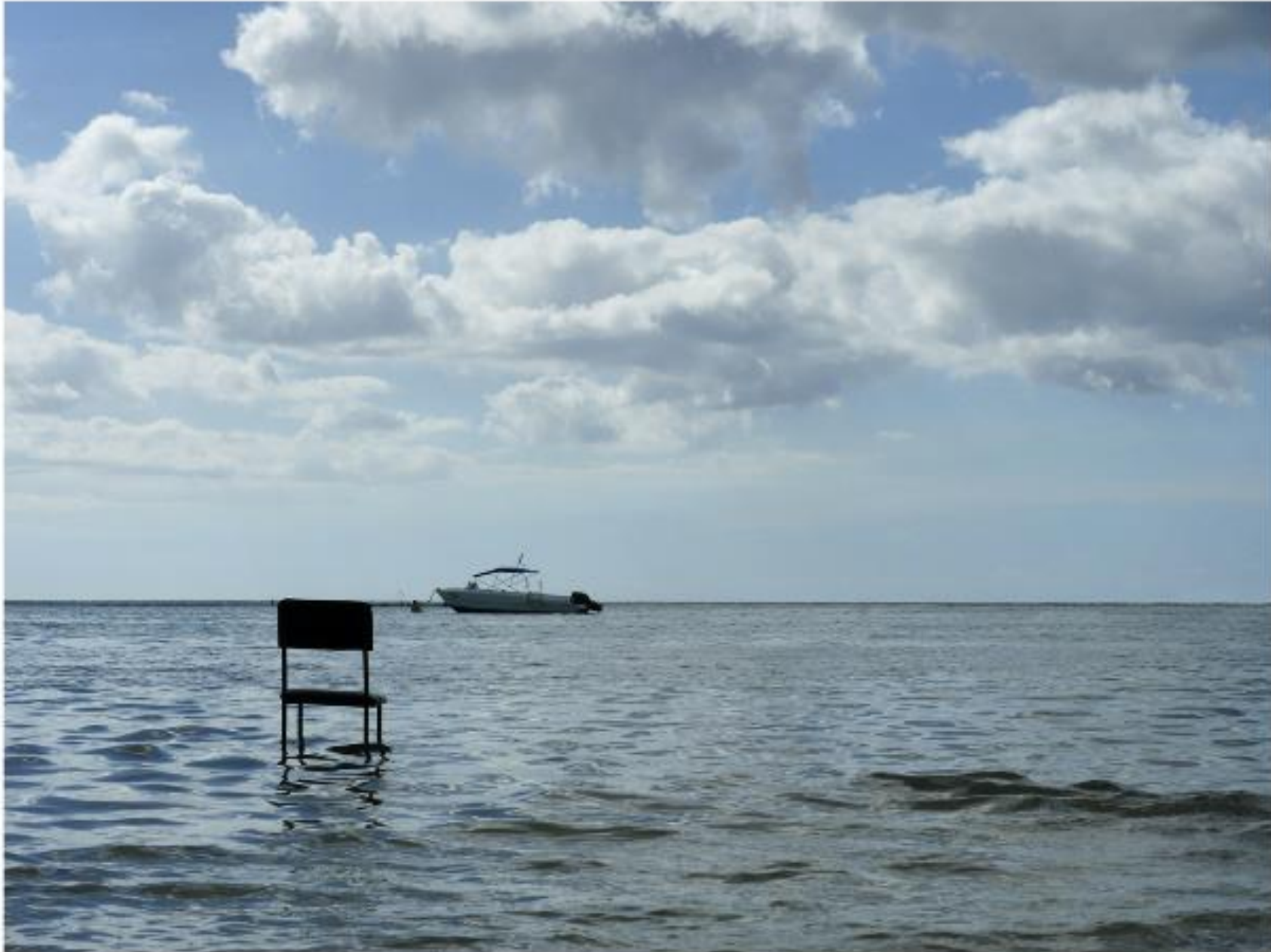
Sureka Sea Watchers 5 Archival print Size variable 1st of 8 editions 2019