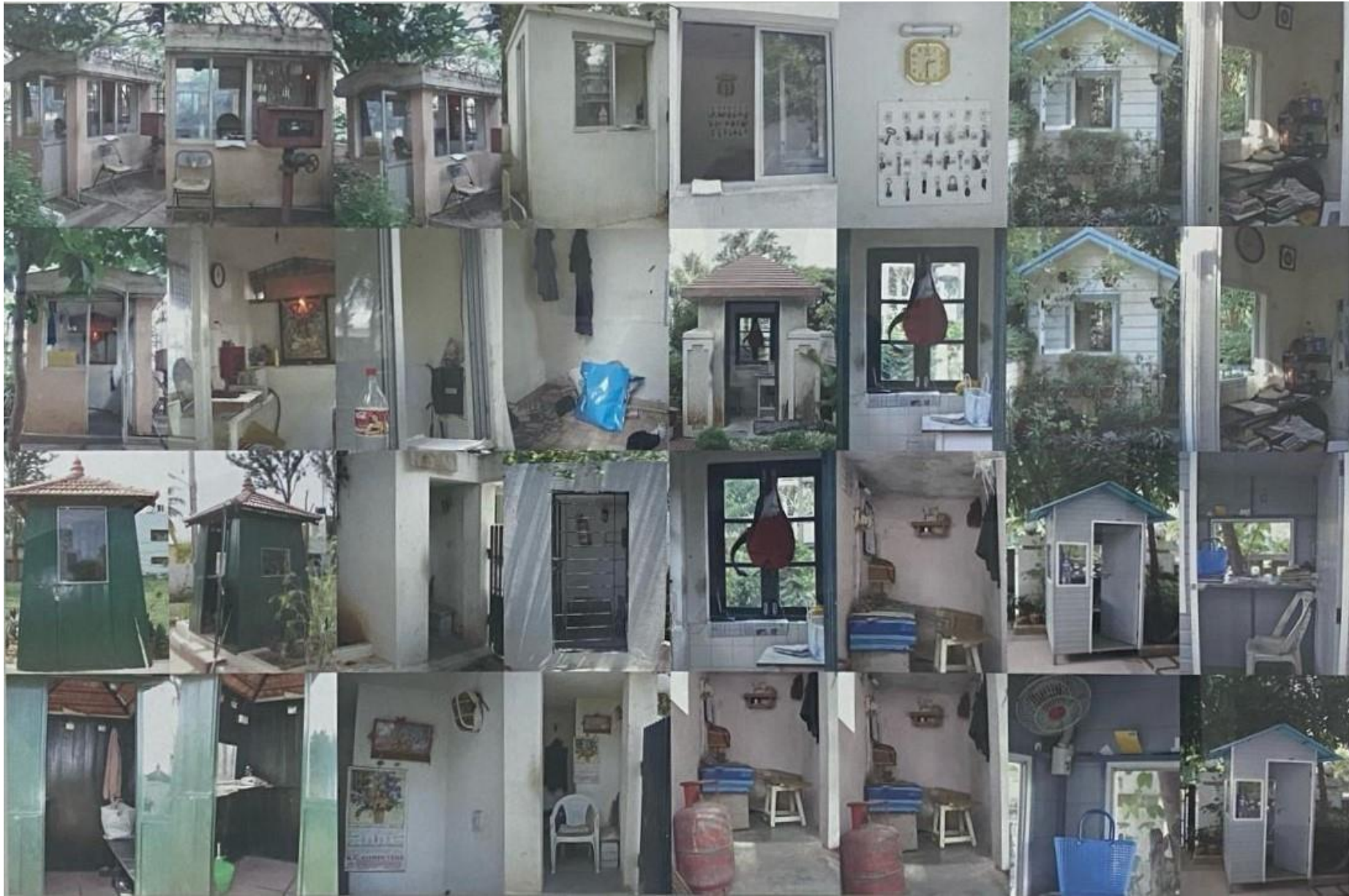
Ayisha Abraham National Security Archival print 28 x 41.5 inches 2008