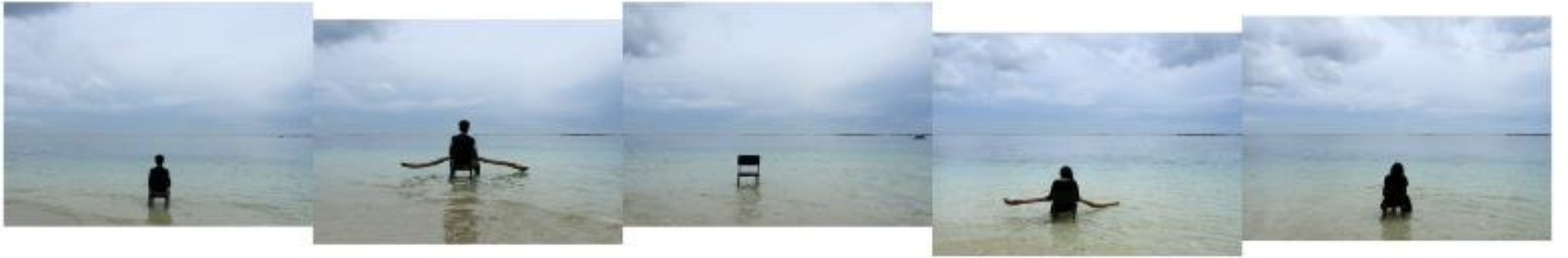
Surekha Sea Watchers 1 Archival print Size variable 1st of 8 editions 2019